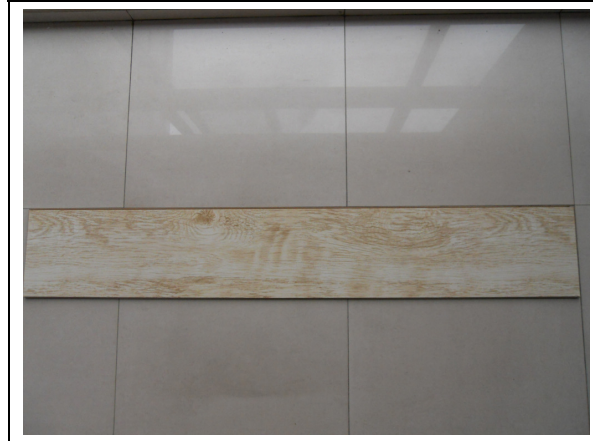
Test sample (back View) (FORTHFLOOR PRATIC AC3 CHINA 2011/05/16 12:50:37 64)