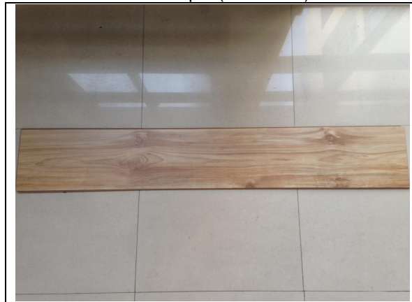
Test sample (back View)

FORTHFLOOR PRATIC AC3 CHINA 2014/04/06 07:30:42 78