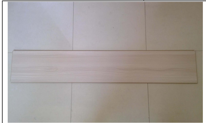
Test sample (back View) (FORTHFLOOR PRATIC AC3 CHINA 2013/06/12 09:46:52 76)